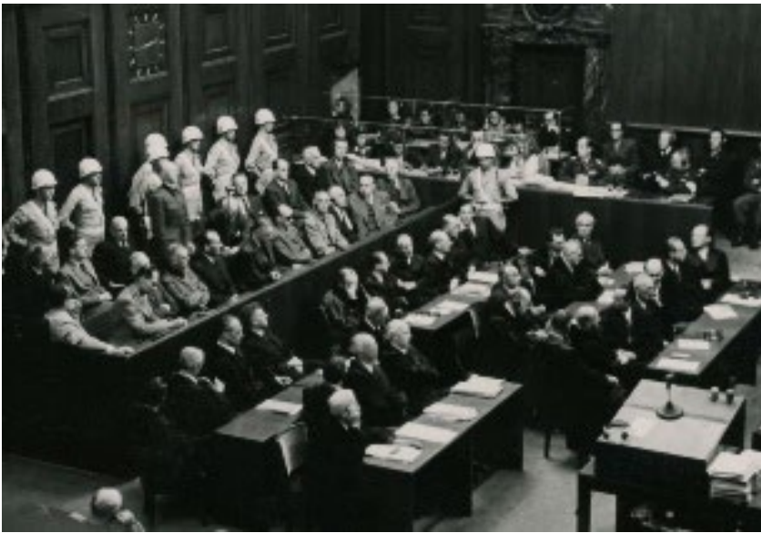
Defendants at the first Nuremberg trial, 1945.